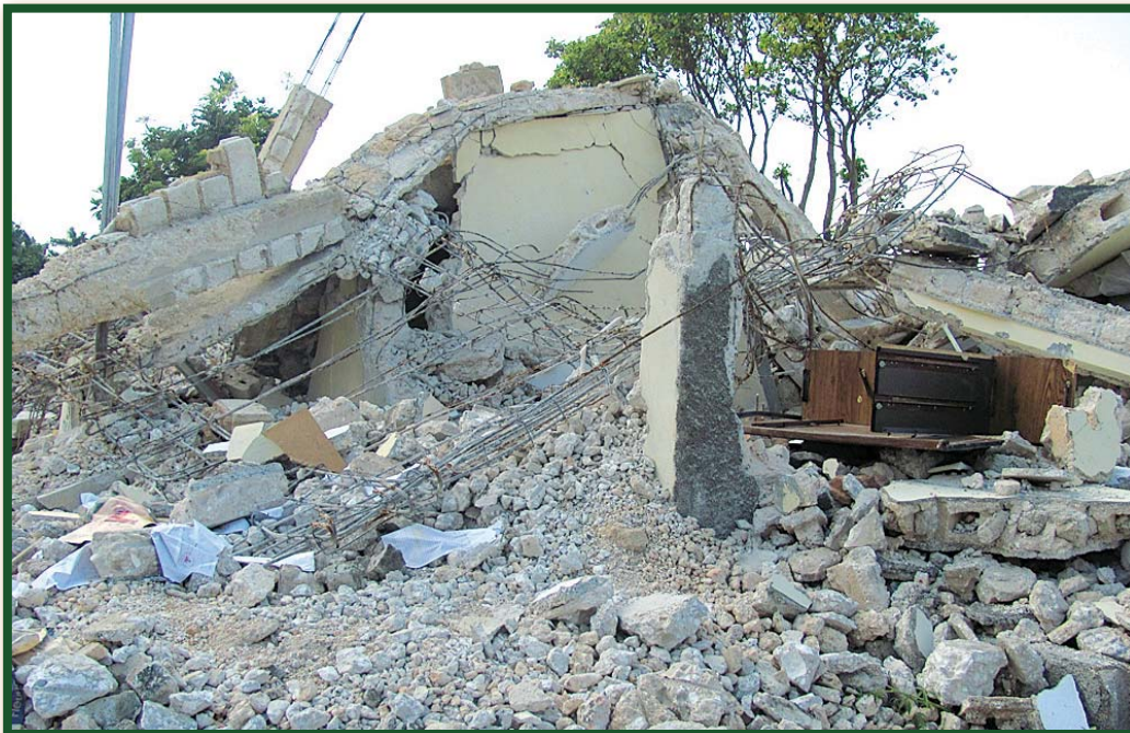
A pile of rubble is all that remains of the restavek school in Gressier, but plans are being made to rebuild as soon as possible.

One of the schools we have agreed to rebuild is a "restavek" school in Gressier, just outside Port-au-Prince. A restavek is a child who lives as a domestic servant with another family because his or her own parents are too poor to provide for the child's basic needs. Restaveks live very hard lives even in the best of times in Haiti, and the Gressier school is one of the few places they can go where they are treated with love and dignity and taught to believe in themselves.