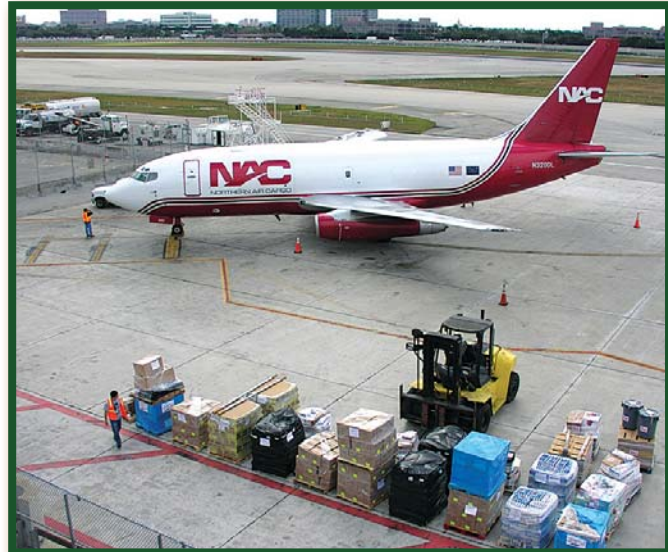
Cross Catholic airlifted thousands of pounds of emergency supplies into Haiti.

Cross Catholic partnered with local churches that had their own trucks and reliable distribution networks. We knew that the parishioners affiliated with these churches would be an indispensable help in moving large amounts of food out of storage and into the mouths of the hungry.