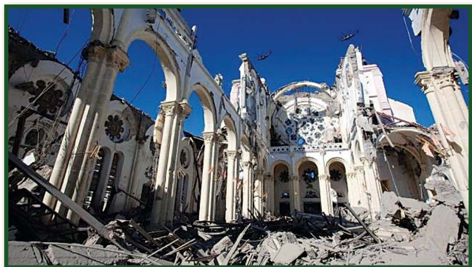
The Port-au-Prince Cathedral was one of many large buildings destroyed by the quake.