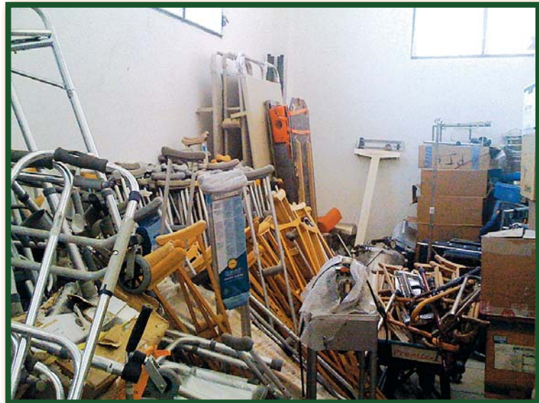
Cross Catholic provided crutches, wheelchairs, and other crucial medical supplies to St. Nicholas Hospital.

To the north in Saint-Marc, Cross committed $40 million in medical supplies and a mobile clinic to St. Nicholas Hospital, where a team of five Christian surgeons from the University of Florida were helping to care for injured survivors. Many of the people pulled from the rubble had to be treated for crushed limbs, broken bones, and open wounds, while routine medical needs had become life-threatening because of a scarcity of functioning hospitals and clinics.